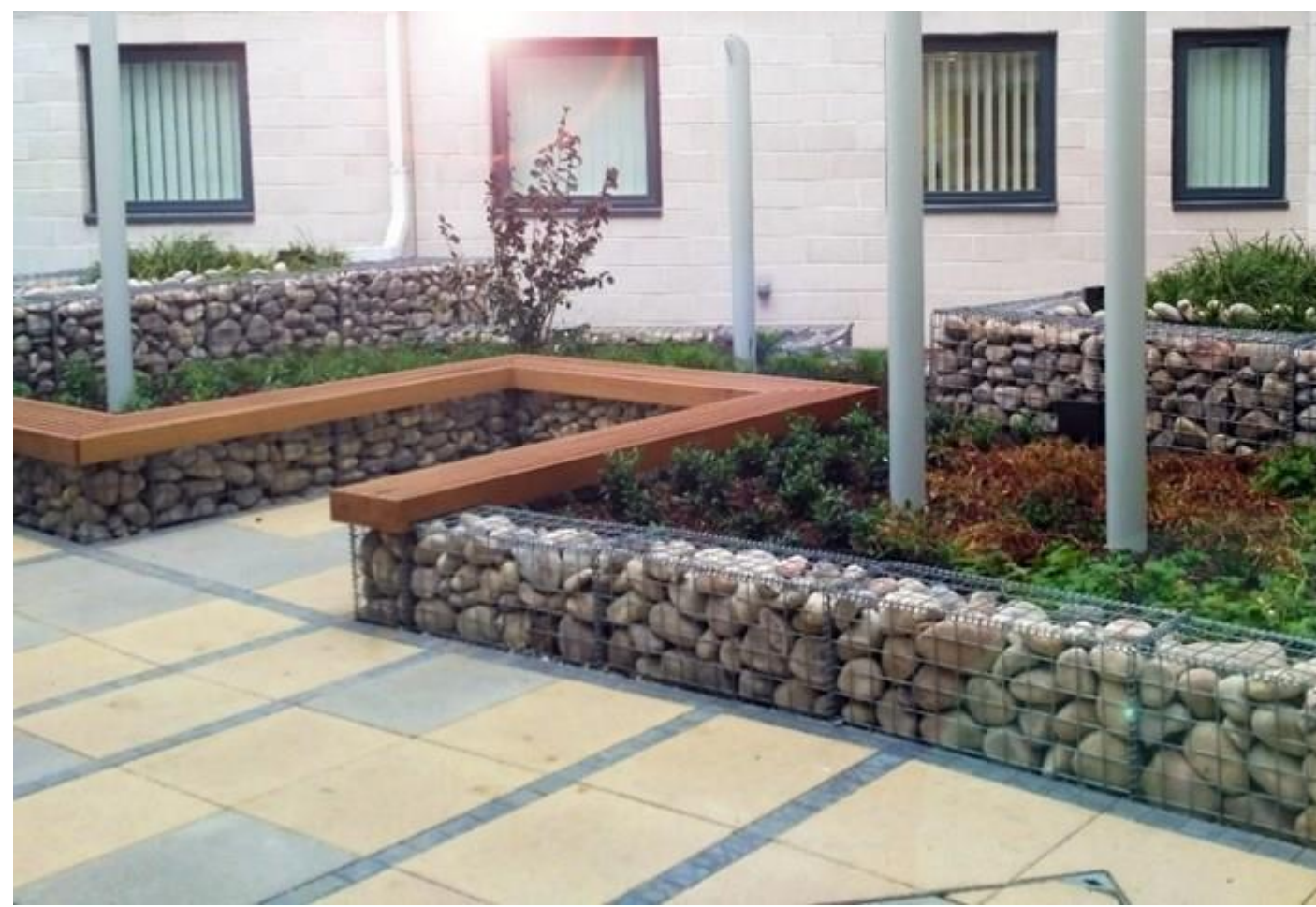
Basildon Hospital SuDS Planters