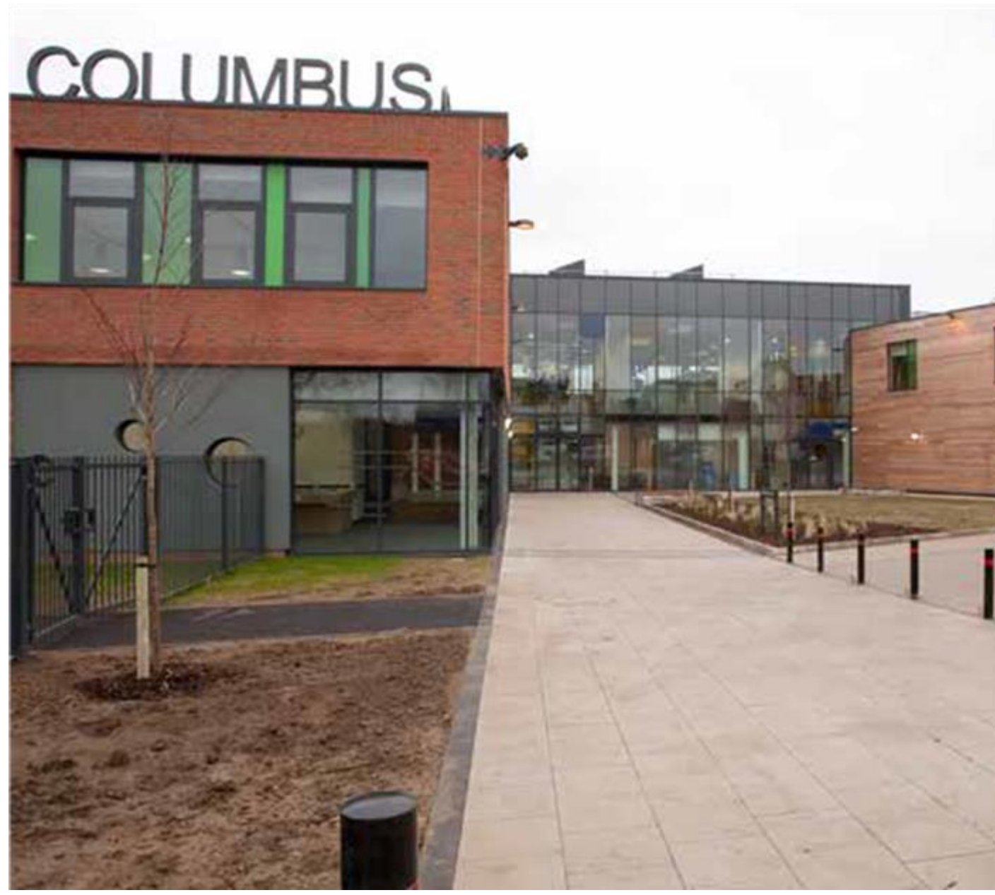
Columbus School and College