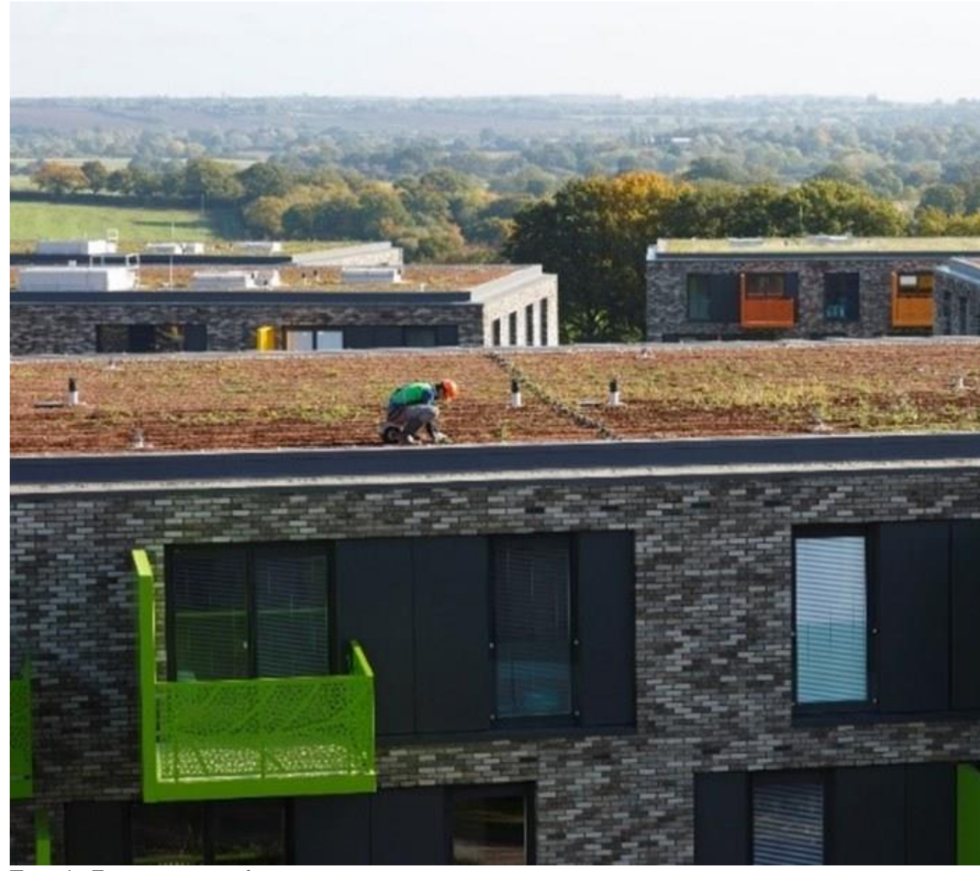
Temple Farm green roofs

This development is an exemplar case study through its early design and consideration of the sustainable drainage scheme along with many other aspects of sustainability, from carbon reducing to noise pollution. This, among other reasons is why the development has been awarded First ever BREEAM Communities innovation credit is claimed by Temple Farm Development. It is also the second BREEAM Communities project to have received an Outstanding rating.