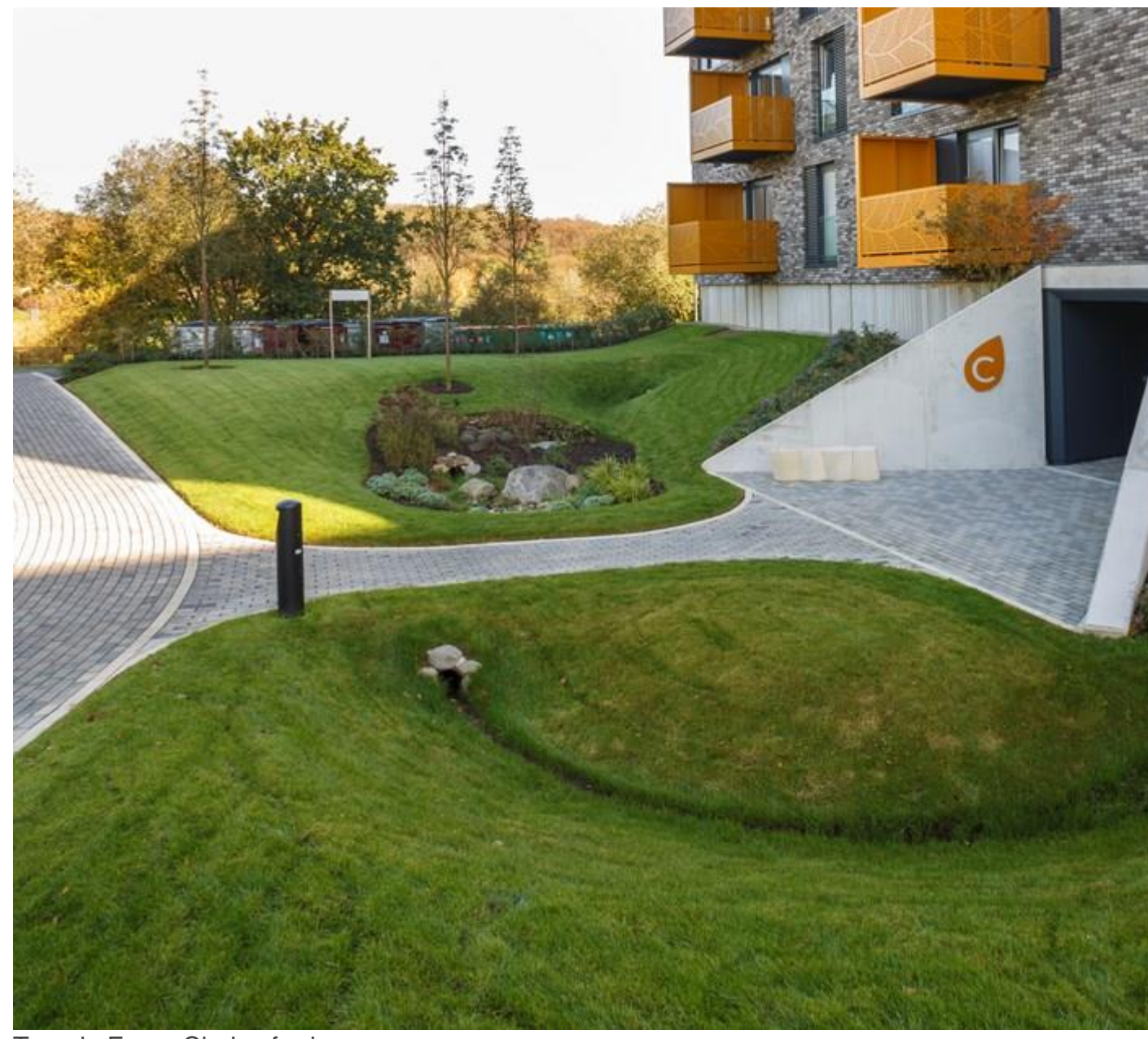
Temple Farm, Chelmsford